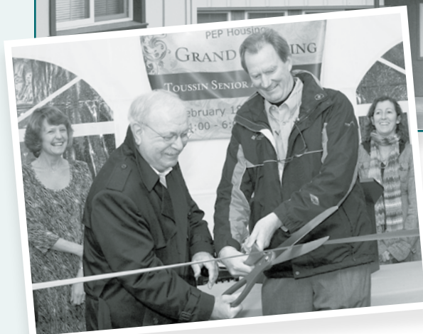
Ribbon cutting ceremony at Toussin Senior Apartments.