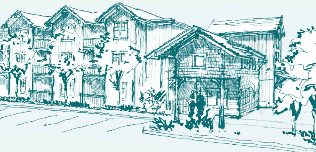
Acacia Lane Senior Apartments

changing face through the seasons and communal food gathering activities, which will be a tribute to the late Luther Burbank. The garden plots will be a raised-bed design, and provide benches for relaxation.