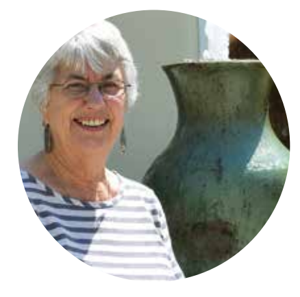
Daniel Drive Apts - 5 units Our First community in 1980. A very small community in a peaceful setting, homey and sweet. Petaluma CA | Built - 1980