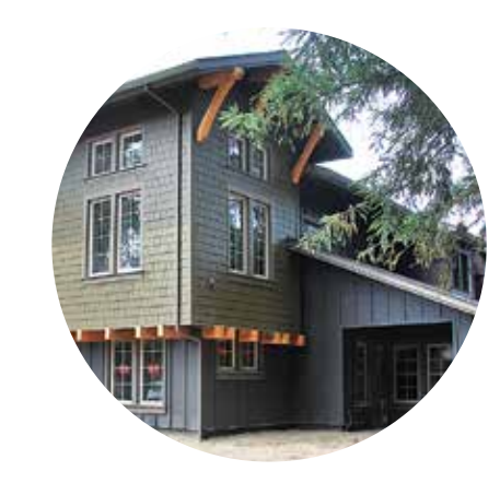
Sun House Senior Apts - 42 units Grand opening August 10, 2017! Featuring a dog run, garden beds & solar panels. Ukiah CA | Built - 2017