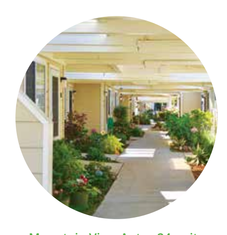
Mountain View Apts - 24 units Twenty 1-bedroom apartments and four 2-bedroom apartments designated for those with disabilities. Petaluma CA | Built - 1991