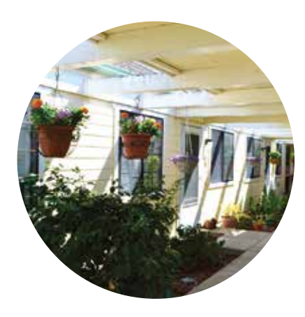
Fisher Senior Apts II - 10 units A quiet setting, set back from the street, very peaceful and comfortable. Petaluma CA | Built - 1984