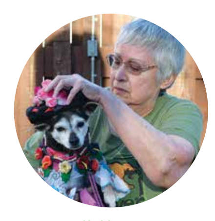
1400 Caulfield Lane - 2 units A charming, quaint, and small community with a close knit and friendly group of residents. Petaluma CA | Built - 2006