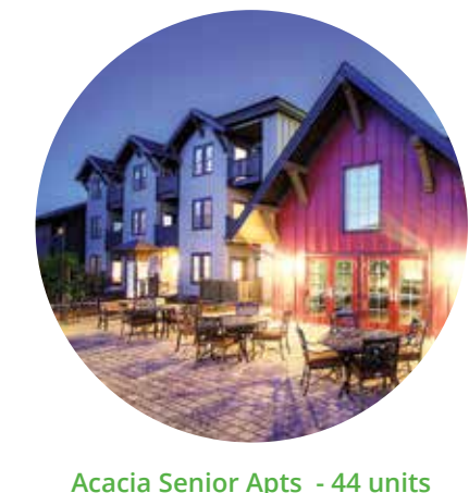
A comfortable 3-story building is home to a very confident group of residents. Solar panels. Petaluma CA | Built - 2012