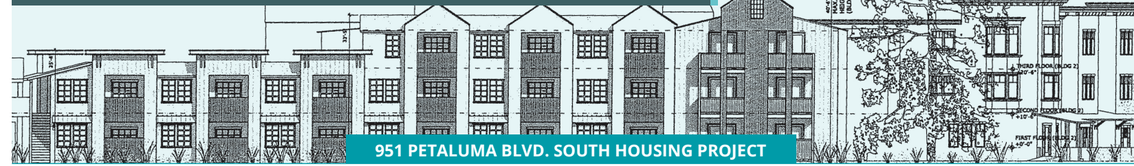
951 PETALUMA BLVD. SOUTH HOUSING PROJECT