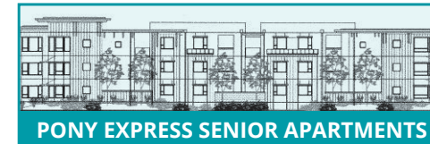
PONY EXPRESS SENIOR APARTMENTS

Our project in Vacaville, Pony Express Senior Apartments, is progressing well. We will go before the Planning Commission in September and the City Council in October. This project will provide 60 units of senior and veterans housing. We expect to break ground in late 2019 or early 2020.