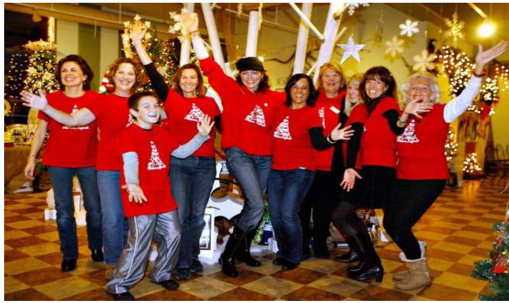
Festival of Trees